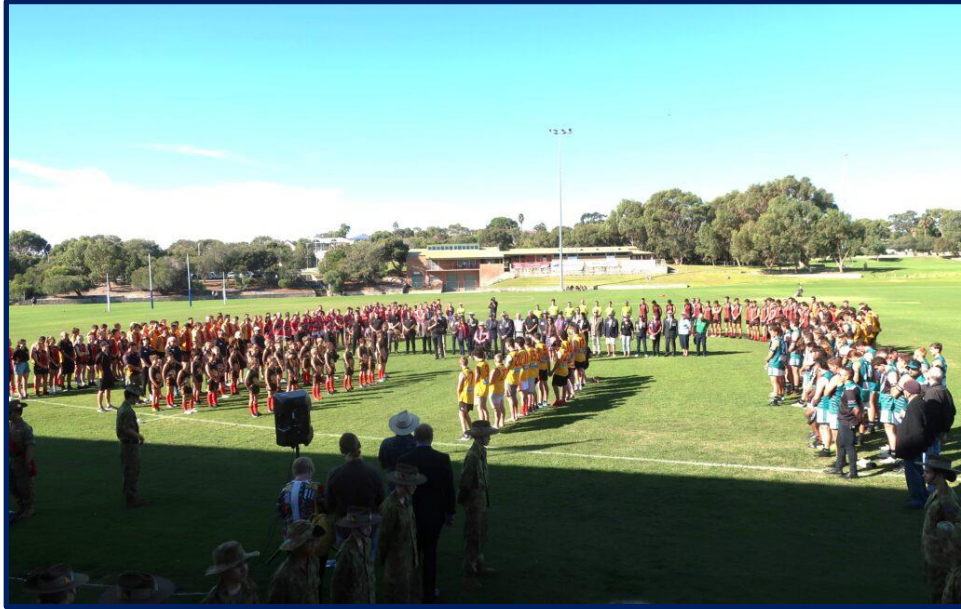
All Paying Their Respects