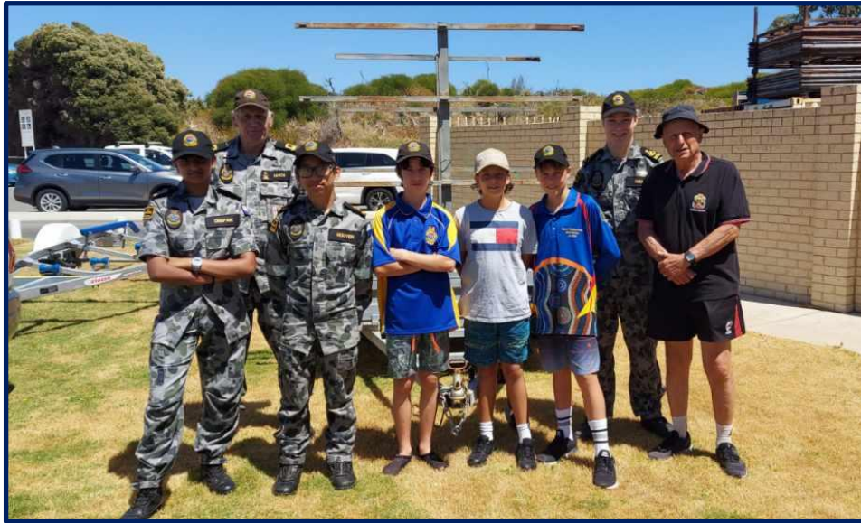
Donation of Old Trailer to TS Marmion At Hillarys Marina

Sunday 19 February had a group of our Kayakers down at the Yacht Club taking delivery of our new Kayak Trailer, thanks to the Stronger Communities Grant. This allowed us to donate our old trailer, that no longer met our needs, to TS Marmion to carry the kayaks we donated to them late last year.