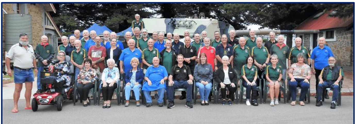
North Beach and Esperance RSL Sub-Branches