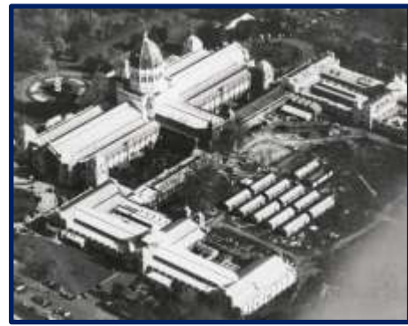
Aerial View showing temporary buildings.

Wartime occupancy of this building began in October 1940 when the RAAF officially requisitioned it under the National Security (General) Regulations for use as a barracks and training facility. In January 1941 No. 1 School of Technical Training was relocated from West Melbourne Technical School and occupied the Exhibition Building and Carlton Gardens from 17 March 1941 to 8 October 1945.