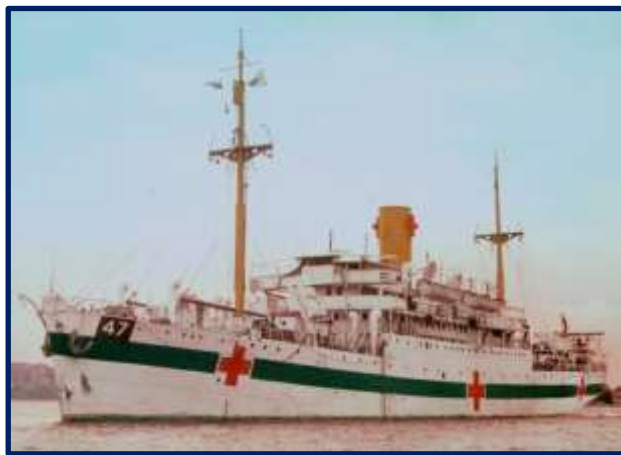
AHS Centaur in 1943 after its conversion to a Hospital Ship