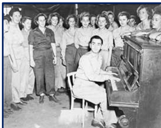
Irving Berlin in New Guinea