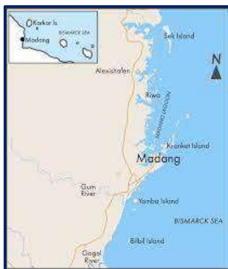
Kranket Island – off Madang

They were to join other units preparing to join McArthur's US forces as they advanced further north in the Pacific towards the Philippines and beyond. Training involved landings, setting up, operating, and dismantling radar stations.