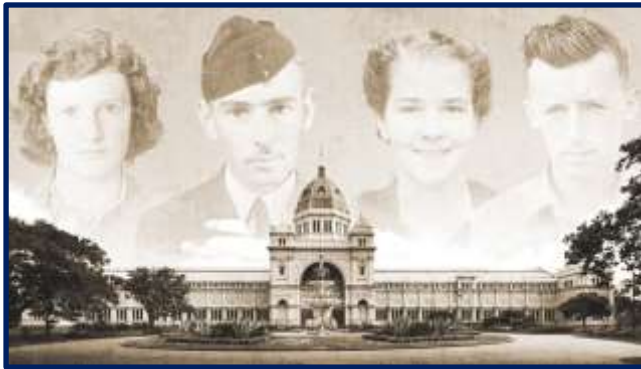
Exhibition Building Melbourne.