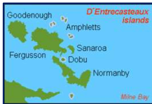
Normanby Island – North East of Milne Bay

Milne Bay at that time was a major United States and Australian base, secured as a result of the Battle of Milne Bay during late August and early September 1942.