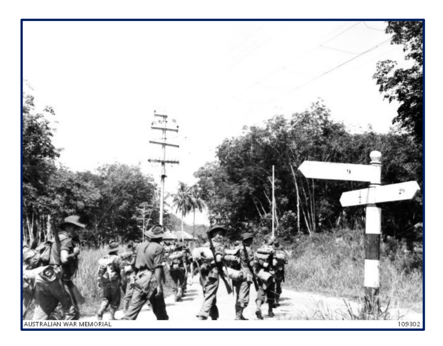
Kevin (looking over his right shoulder) in the Brunei Bay area, Borneo.

Morotai was being used as a staging area in preparation for the 7th and 9th Divisions amphibious operations on Borneo. The 24th Brigade landed on "Brown Beach" on Labuan Island on 10 June. It took the 2/28th and 2/43rd 11 days to clear the island. The strongest Japanese resistance came from the area called the "Pocket". The battle began on 15 June and, after almost a week of shelling, air strikes, and naval bombardment, the 2/28th captured the position. The Pocket was captured on 21 June and the 2/28th moved to Beaufort, on the opposite side of Brunei Bay, spending the final weeks of the war patrolling the surrounding area.